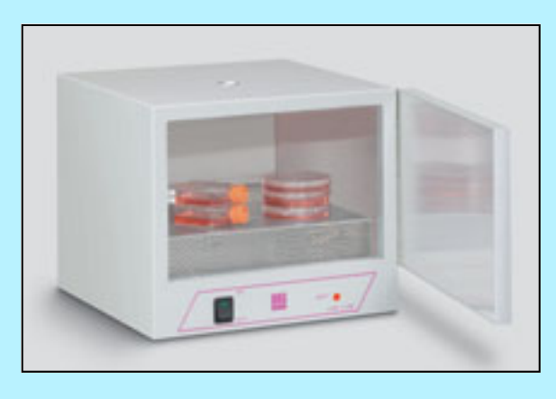
New and refurbished incubators tailored to your test volume and budget.